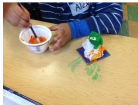
Paint a pumpkin sculpture with REAL pumpkin pie filling.

Make it sensory, interactive and three-dimensional.