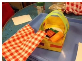
Basket for Little Red Riding Hood

Have action! Plan for students to use their art in imaginative, dramatic play, like flipping pancakes or playing instruments.