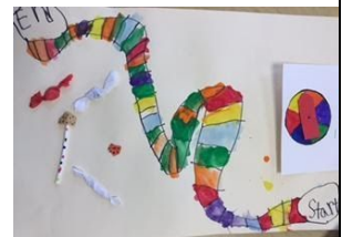
Candyland Game Primary Color Wheel

Keep lessons connected, each one relating to the next one.